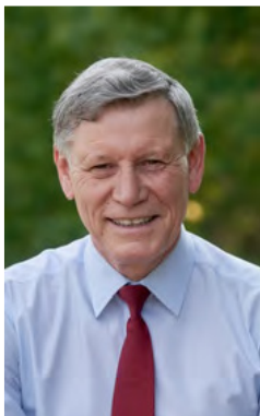
Terry Duguid MP/député